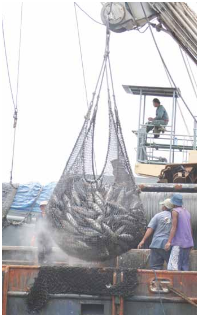
A big haul...a Taiwanese ship in Pohnpei transshipping frozen skipjack and bigeye tuna.

fishing fleets operate within their 200-mile Exclusive Economic Zones.