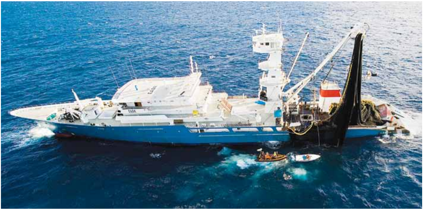
Purseiner at work...PNA countries are putting in place measures to control the exploitation of tuna, their major source of income.